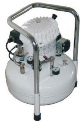
Optional ultra-quiet lab/ office compressor

Welded steel with clean powder-coated finish