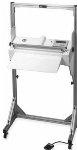
Optional ergonomic multi-position Accu-Seal stand (shown w/model 635-232)

Features and specifications subject to change without notice.