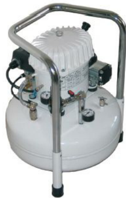
Optional ultra-quiet lab/ office compressor

The Accu-Seal 35 helps insure the integrity of your products. When used with a heat sealable, electrostatic safe (ESD), moisture vapor barrier bag with desiccant and humidity indicator card, it provides the maximum protection against moisture and oxygen contamination.